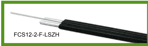
Self-Supporting Bow-type drop Cable,Multi mode,duplex