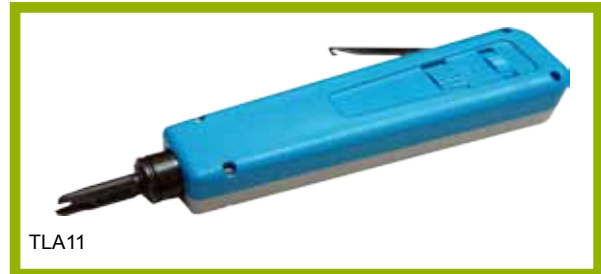
Single pair 110 style impact tools