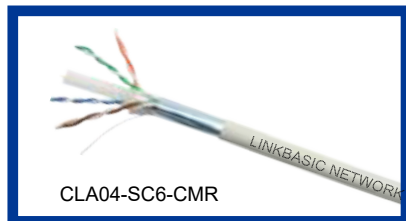
Cat 6 FTP solid cable RAL 7035