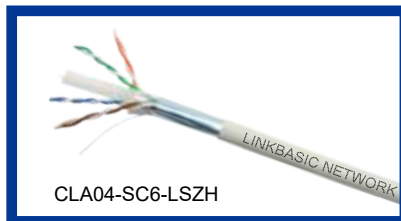
Cat 6 FTP solid cable RAL 7035