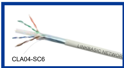
Cat 6 FTP solid cable RAL 7035