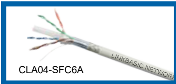
Cat 6A FTP solid cable RAL 7035