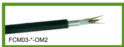
Multi Mode Out Optical Cable