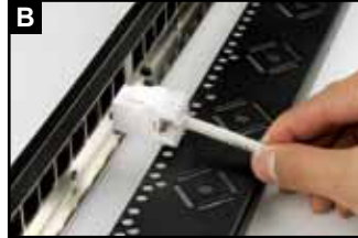
Position the shielded keystone jack for installation.