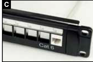
Insert the jack into the mounting location properly.