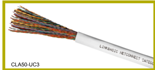
Cat 3 50-pair UTP Solid Cable

SOLID CABLE,CAT3,UTP,50pairs, 24AWG,1000feet