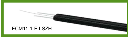
Bow-type drop Cable, Multi mode, simplex