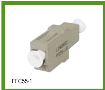
LC-LC Simplex Adapter