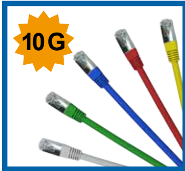
Cat 6A FTP Patch Cable

PATCH CORD, CAT6A, FTP, RJ45, molded boot, available in different length and color.