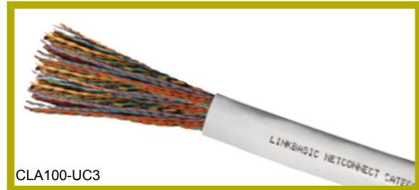
Cat 3 100-pair UTP Solid Cable

SOLID CABLE, CAT3, UTP, 100pairs, 24AWG, 1000feet