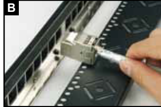
Position the shielded keystone jack for installation.