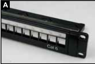
The bracket of Cat 6 patch panel.