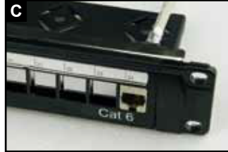
Insert the jack into the mounting location properly.