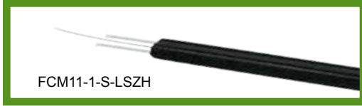
Bow-type drop Cable, Multi mode, simplex